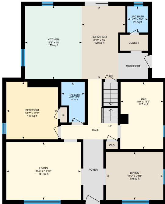
Main Floor Exterior Area 1293.61 sq ft

Main Building: Total Exterior Area Above Grade 2346.36 sq ft