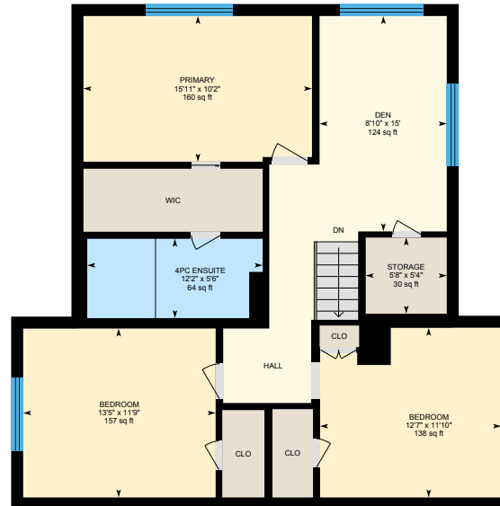
2nd Floor Exterior Area 1052.74 sq ft